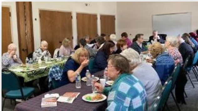
TCGS 2022 Annual Meeting and Potluck