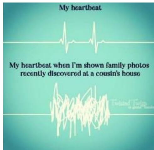
~ from Twisted Twigs on Gnarled Branches Genealogy